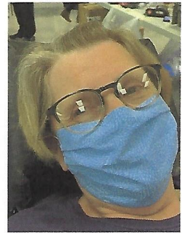
Mary Potter 2 Gallons